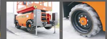
Automatic leveling outriggers Non marking tyre