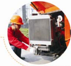
Swing-out engine tray