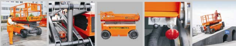
Waterproof Safety bar Folding guardrails Brake release valve Gradeability